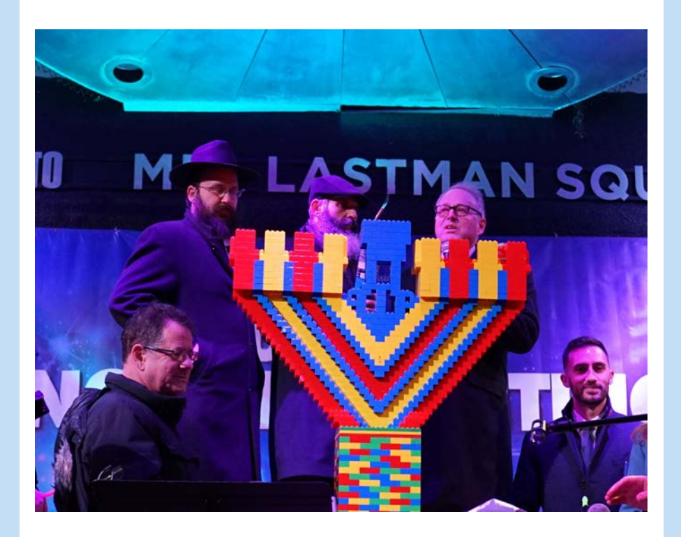
the fabric of York Centre for decades. Wishing them continued success.