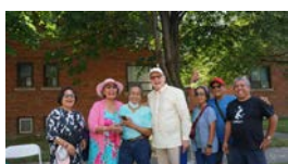
Incredible experience to be part of our annual and local Fun Philippines event!