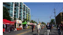
From entertainment to amazing Filipino cuisine, the event was an amazing success. We are proud to be the home of one of the largest Filipino communities in the entire country.