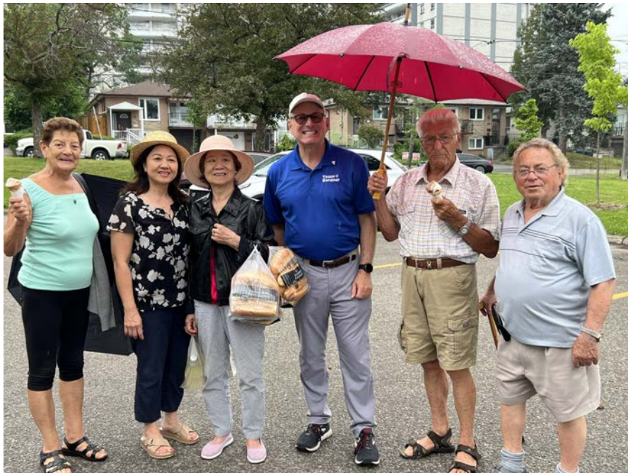
Our ice cream express, part of the York Centre 2023 Grand Tour, continued at Grandravine Community Centre. Great to meet local residents and share an ice cream with them.